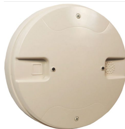
WIDP-WGI WIRELESS GATEWAY MODULE

The SWIFT system can be installed using only hand tools. However, the SWIFT Tools PC utility provides many benefits to a site evaluation (Site